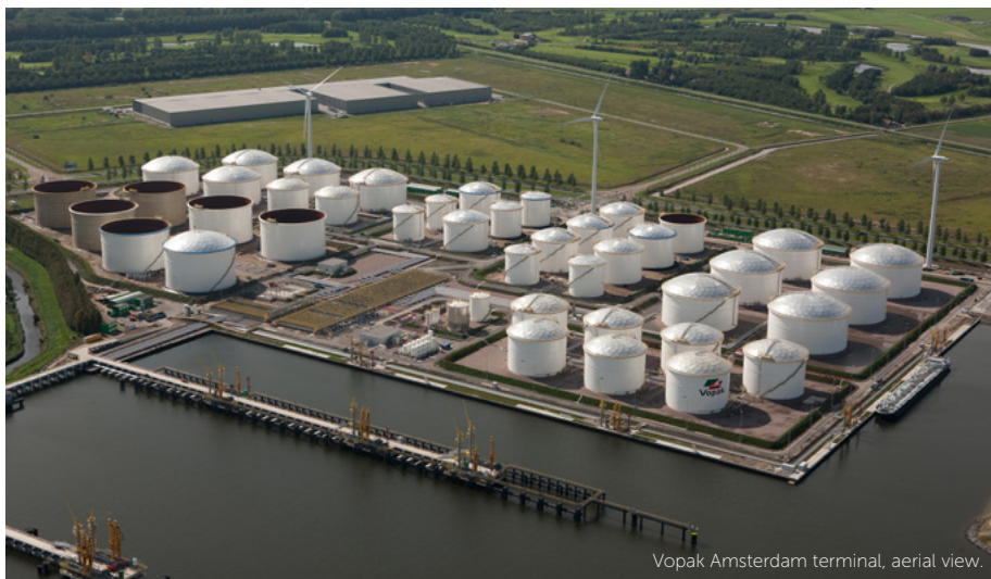
Vopak Amsterdam terminal, aerial view.

If this datasheet triggers more questions our team of experts will be always available to support and assist you in selecting the optimal solution for your specific application.